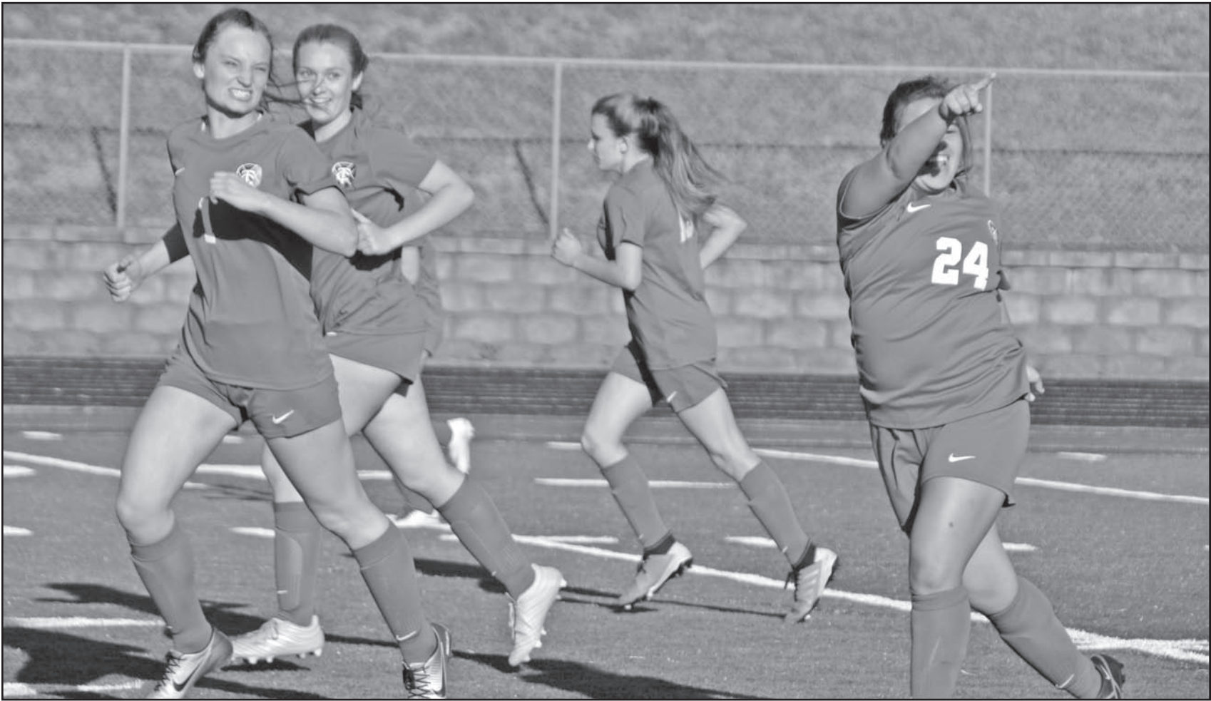
The fifth-ranked Lady Indians are gearing up for postseason soccer where they will visit fourth-ranked Armuchee (9-3) in round one.

"We finally played a complete game versus a top-tier